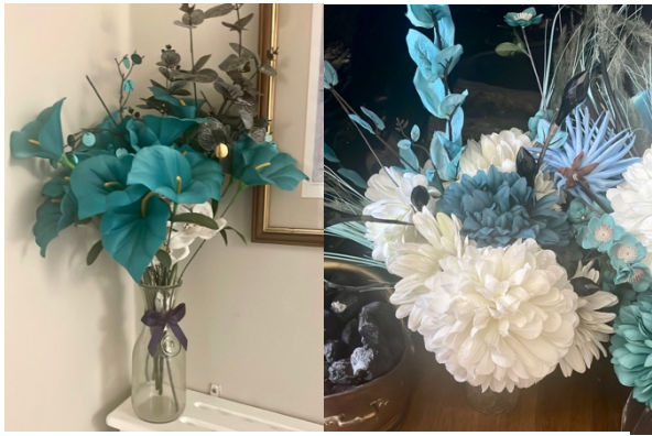
Residents' beautiful flower arrangements